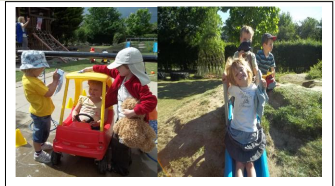
lunch and tidy up times.

We have been enjoying beautiful weather so far this summer which means we have been able to spend lovely long days learning outside in the garden amongst, (I must say) some amazing thriving vegetable seedlings and wild flowers which were planted and taken care of by the children. Thank you very much to all of our keen little gardeners who have been helping to water them!